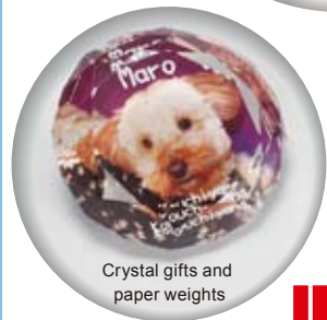
Crystal gifts and paper weights

Compact & Tabletop Printer for everything up to 50 mm thickness