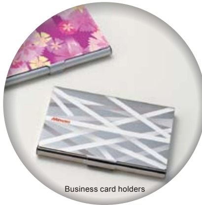
Business card holders