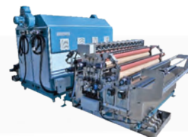
TR600-1850W Up to 230Lm/h