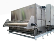
TR600-1850S Up to 260Lm/h