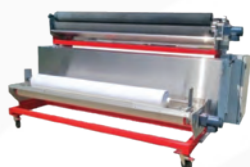
TR300-1850C Up to 100Lm/h