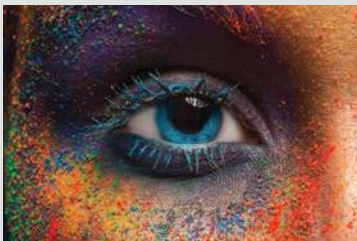
Nozzle Recovery System

Lower ink cost compared to solvent or latex machines