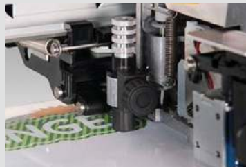
ID Cut Function

Automatically assigns operational nozzles when an outage is detected